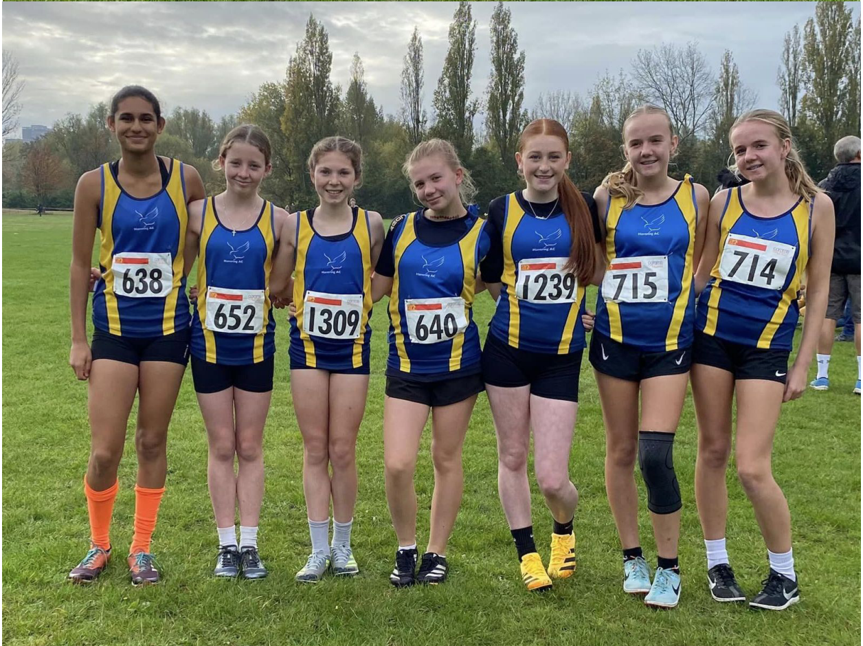
For more action & team photos see Havering AC Facebook Group (members only)